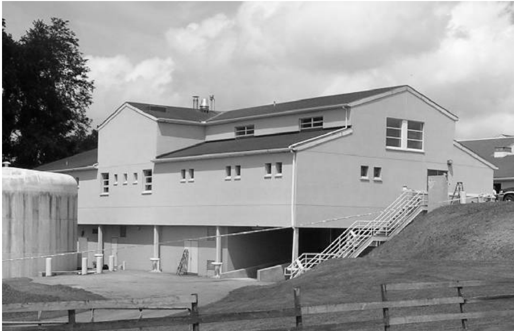
George D. Widener Large Animal Hospital