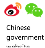
Chinese government website